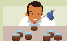
SOIL SCREENING AND/ OR SOIL TESTING