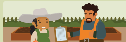
CUSTOM RECOMMENDATIONS FOR YOUR GARDEN