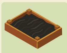
USE RAISED BEDS